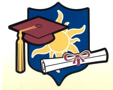
SJGIF Scholarship Foundation