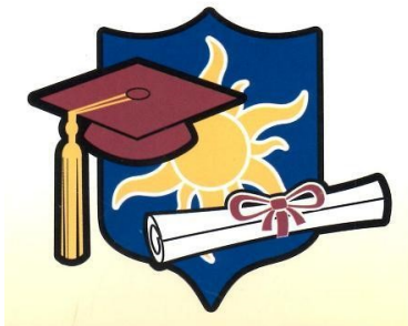
SJGIF Scholarship Foundation