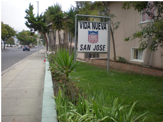
Vida Nueva SLE is a San Jose GI Forum Community Service Project

Vida Nueva accepts men of all races who can live amicably with others. We have Americans with Disabilities Act (ADA) approved beds and bathrooms to serve the physically impaired.