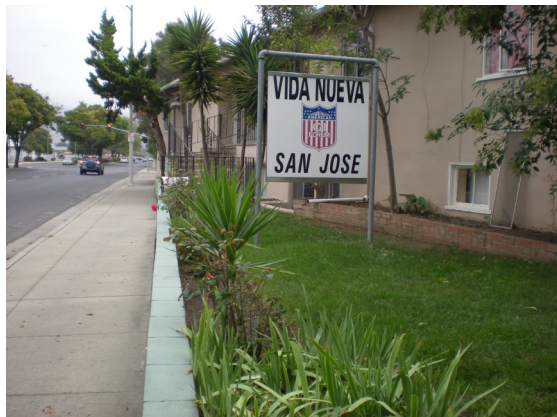
Vida Nueva SLE is a San Jose GI Forum Community Service Project

Vida Nueva accepts men of all races who can live amicably with others. We have Americans with Disabilities Act (ADA) approved beds and bathrooms to serve the physically impaired.